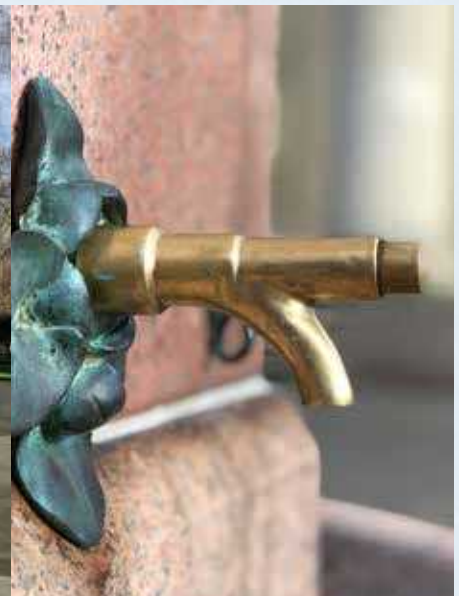
The Nathaniel Montefiore Fountain, St. James' Church Gardens, Old Jamaica Road, Bermondsey