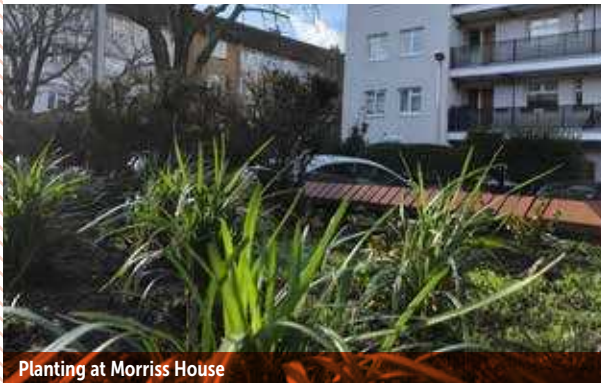
Planting at Morriss House

The TRA received Council funding to put extra plants in the raised flower beds on the Cherry Garden Estate. Lots of different flowers were planted in January; more will follow.