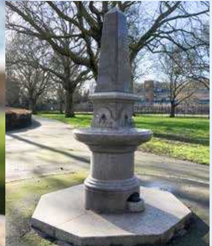
The Jabez West Fountain, Southwark Park