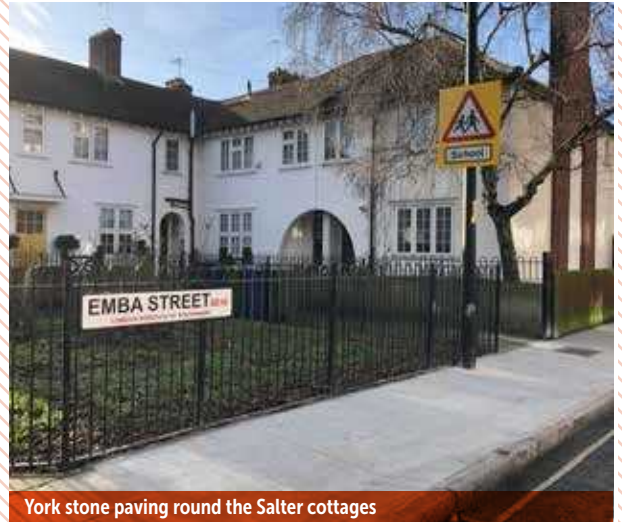
York stone paving round the Salter cottages